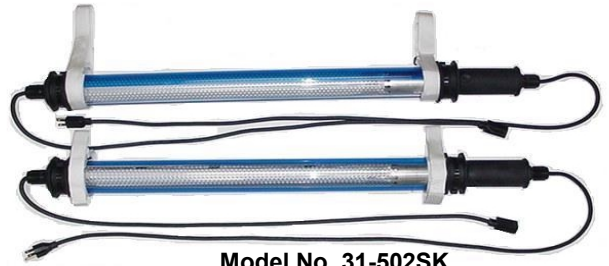
Model No. 31-502SK NSN 6230-01-465-8931