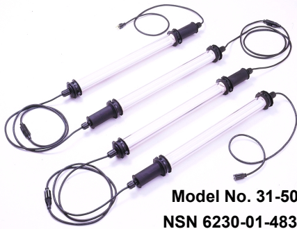
Model No. 31-5004M NSN 6230-01-483-7562